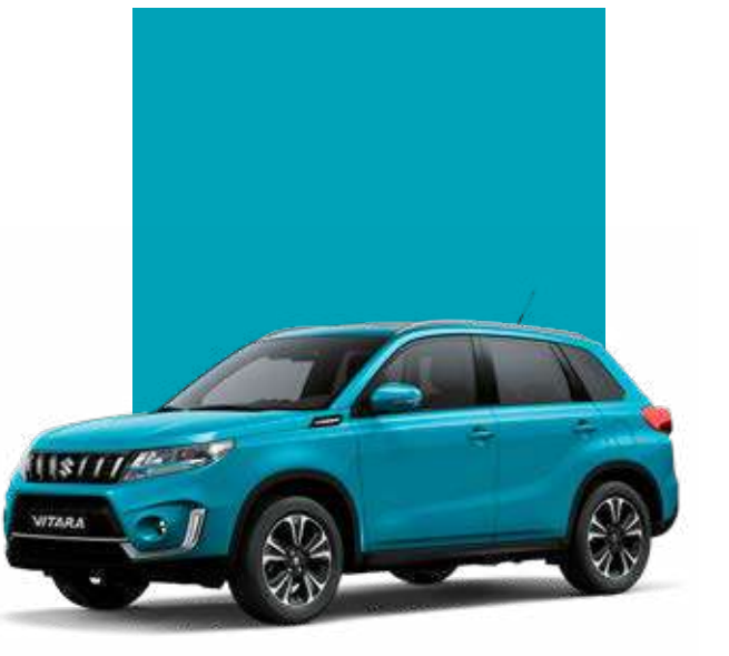
Atlantis Turquoise Pearl Metallic