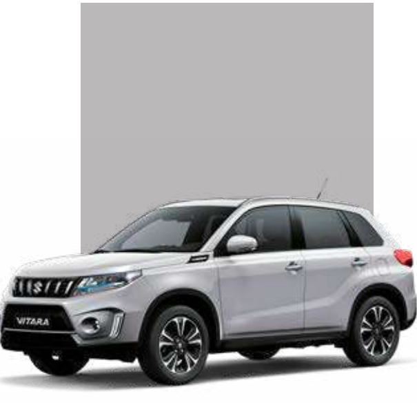
Silky Silver Metallic