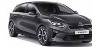
Penta Metal (H8G)