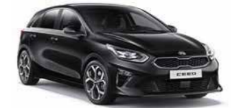
Black Pearl (1K)