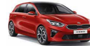
Infra Red (AA9)