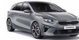
Lunar Silver (CSS)