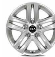
16" alloy wheel (K2)