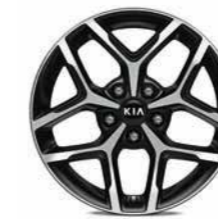
GTL 17" alloy wheel (GT Line)