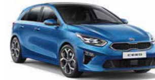
Blue Flame (B3L)