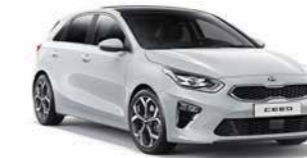
Cassa White (WD)