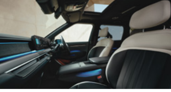
GT-line - Two-tone Vegan Leather