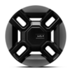
GT-line - 21" Alloy Wheel