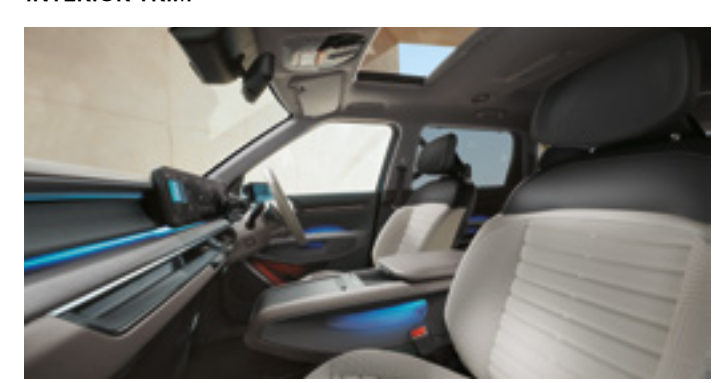
Earth - Two-tone Vegan Leather