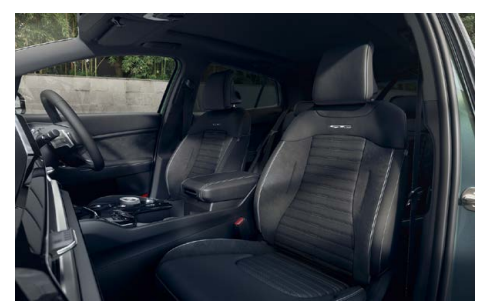
GT-line - Suede & Pressed Faux Leather Seat Upholstery

K4 - Ice Coffee Beige Leather Seat Upholstery