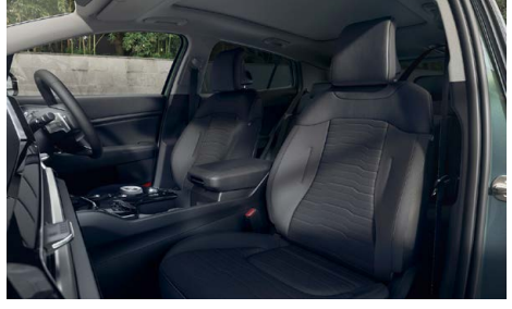
K3 - Black Saturn Cloth & Faux Leather Seat Upholstery