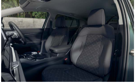
K2 - Black Premium Cloth Seat Upholstery