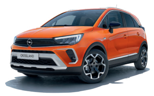
Power Orange Premium paint*