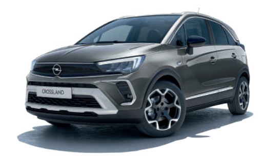
Moonstone Grey Metallic paint*