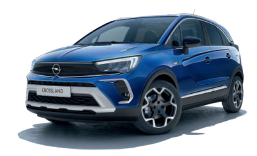
Nautic Blue Standard paint*

E&OE July 2022. Images shown for illustration purposes only. Please discuss colours available with your local Opel Dealer. *Premium, Metallic and Brilliant paint optional at extra cost. Standard paint at no optional extra cost. Due to the limitations of the printing process, the colours reproduced may vary slightly from the actual paint colour and trim material. As a result, they should be used as a guide only. Your Opel dealer has a comprehensive display of paint finishes.