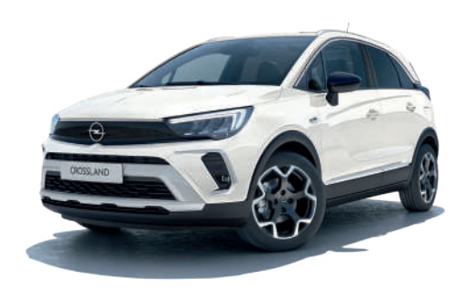
White Jade Brilliant paint*