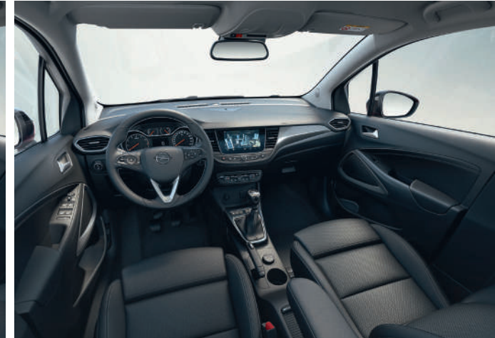
SC: Jet black Peanut cloth seat trim