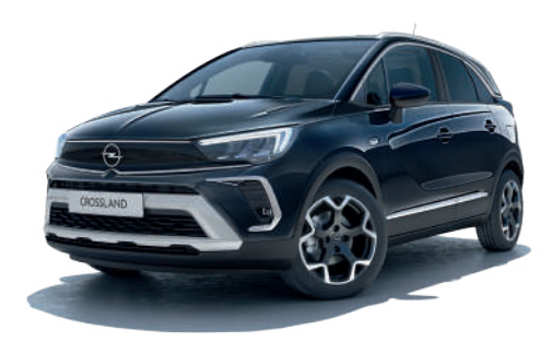
Diamond Black Metallic paint*