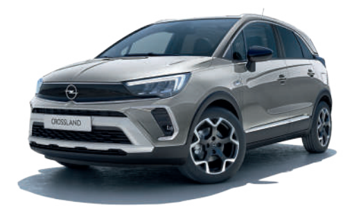
Quarz Grey Metallic paint*