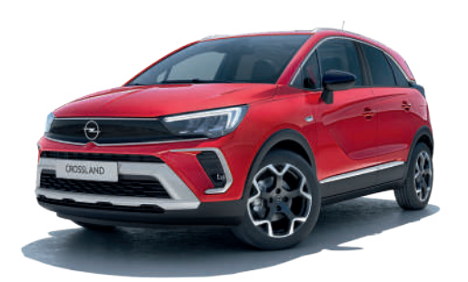
Hot Red Premium paint*