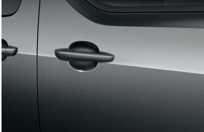
Moonstone Grey Metallic*