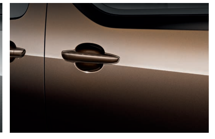
Rich Oak Brown Metallic*

E&OE March 2022. Images shown for illustration purposes only. Please discuss colours available with your local Opel Dealer. *Optional at extra cost. Standard paint at no optional extra cost. Due to the limitations of the printing process, the colours reproduced may vary slightly from the actual paint colour and trim material. As a result, they should be used as a guide only. Your Opel dealer has a comprehensive display of paint finishes.