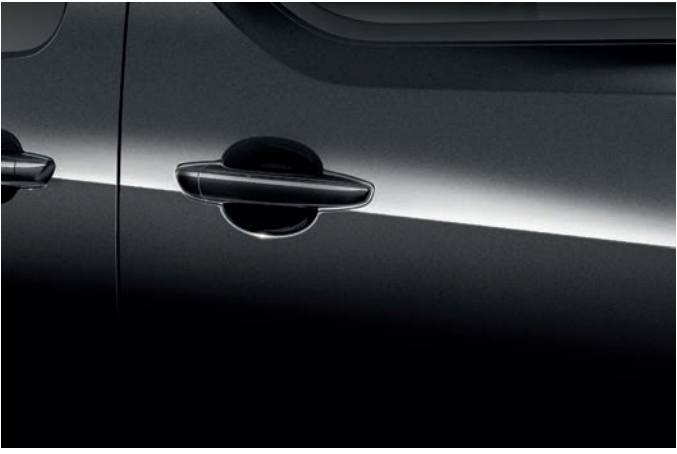
Diamond Black Metallic*