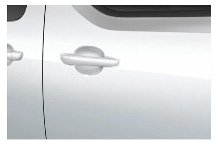
White Jade Solid