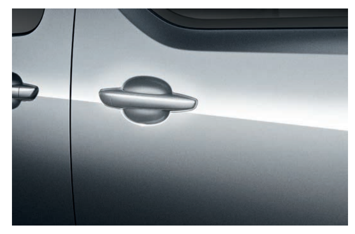
Quartz Grey Metallic*